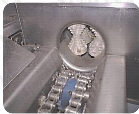
Max. Feeding Diameter: 75mm