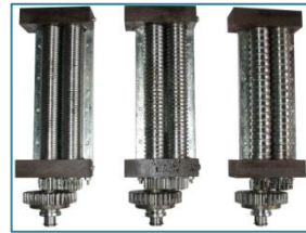
Available with 1.5mm, 2mm, 3mm, 5mm, 8mm Noodle Cutter