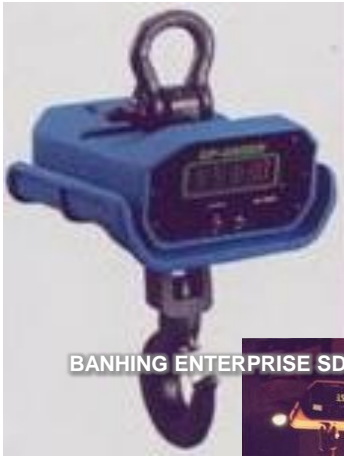
BANHING ENTERPRISE SDN BHD