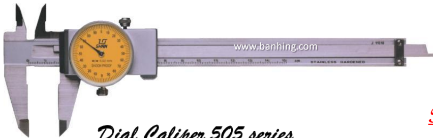
Dial Caliper 505 series